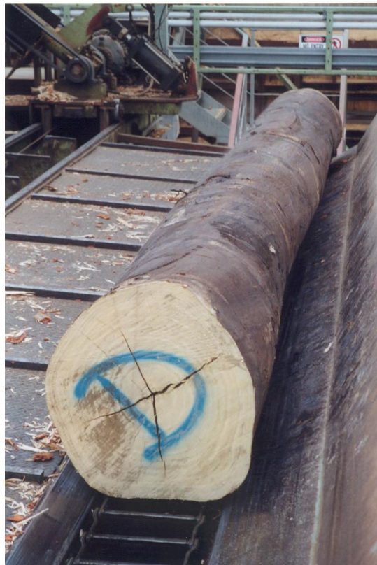
Figure 3: E. nitens 15 years old prepared for sawing