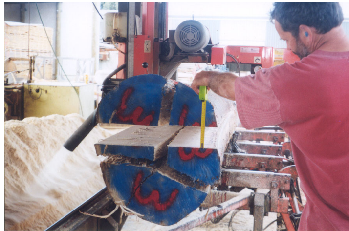
Figure 2: E. nitens 15 yr old - flitch movement during sawing

Carter Holt Harvey Ltd (LVL manufacture). Major funding was provided by the Foundation for Science Research and Technology with further financial support from Forestry Tasmania.