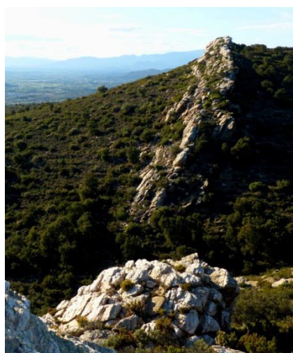
fig 1. Outcrop of the Roses Quartz Vein. View towards the NW. The depressed area on top left belongs to the Neogene Empordà basin.

In the NW section (NWS) the vein is hosted by a granodiorite of Variscan age affected by a network of shear zones (Carreras et al., 2004). In this section, the vein dips approximately 65° to the SE, pinching and becoming sub-vertical in the central part of the NWS. In the SE section (SES) the vein is hosted by pre-Variscan fine-grained metasedimentary rocks dipping from sub-vertical to the NW.