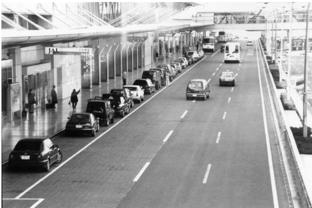
airport terminal / so

In this part, you can move to the next question by clicking on Next . If you want to return to a previous question, click on Back . You will have 8 minutes to complete this part of the test.