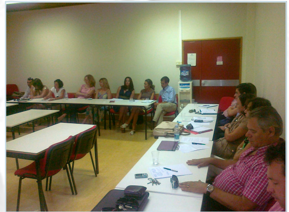
A group of people are seated at long white tables in a room that appears to be a classroom or a meeting space. In the foreground, a man in a light blue shirt and dark tie is seated at a table, looking towards the right. To his left, another man in a pink and white striped shirt is seated, resting his chin on his hand. Behind them, a woman in a red top is seated at the same table. To the right, two more women are seated at a separate table; one is wearing a patterned top and the other a white headband. The room has a whiteboard in the background and a computer monitor on a stand. The overall atmosphere is professional and focused.

A group of men are seated at a long white table in a classroom, facing a whiteboard. The man at the far end of the table is writing on the whiteboard. The other men are looking towards the whiteboard. There are papers and a pen on the table. A man is also sitting at a separate table on the right side of the room, looking towards the whiteboard. The room has large windows with blinds on the left and a whiteboard at the front.