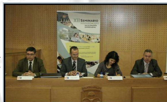
XIIth Hispano-Luso Seminar on Business Economics

XIIth Hispano-Luso Seminar on Business Economics , organised by the University of Vigo (Ourense campus), on 25-26 November.