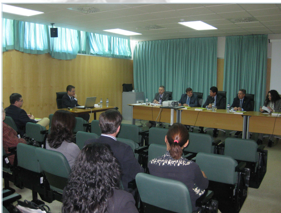
Doctoral Thesis: "Institutional analysis of the environmental management practices of the golf courses of Andalusia".