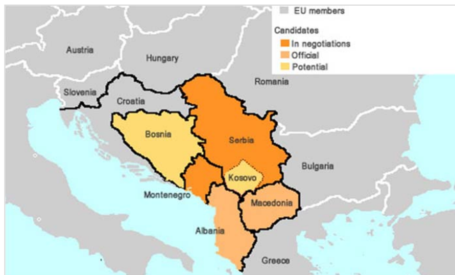
Figure 1. Western Balkans map showing legends in relation to EU.

therefore, have a historic chance of benefiting from the lucrative EU market for the tourism sector. Current accession talks indicate that joining the EU is a common agenda for all these countries (European Commission, 2019) and a unified approach to tourism development sounds a reasonable strategy for these countries to jointly benefit from the EU market, in near future. This shared goal is embodied in the form of an official entity as Western Balkans Fund (WBF), which serves to establish “the development of closer cooperation and strengthening of ties between the Western Balkans contracting parties” ( http://westernbalkansfund.org/mission/ ). The mission of WBF states that the purposes of the establishment of the entity includes “the integration of the contracting parties into the European Union and common presentation of the WBF contracting parties to the third countries” ( http://westernbalkansfund.org/mission/ ). In its objectives, the WBF identifies specifically that the fund aims to “take a sustainable development approach” in developing different sectors in the region. Figure 1 shows the Western Balkans map in relation to EU accession status of the countries in the region.